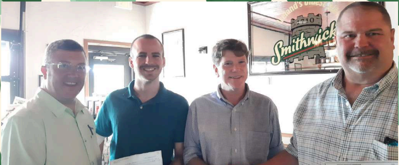
St. Vincent de Paul Donation