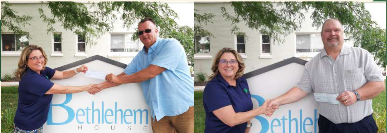
Division Bethlehem House Donation