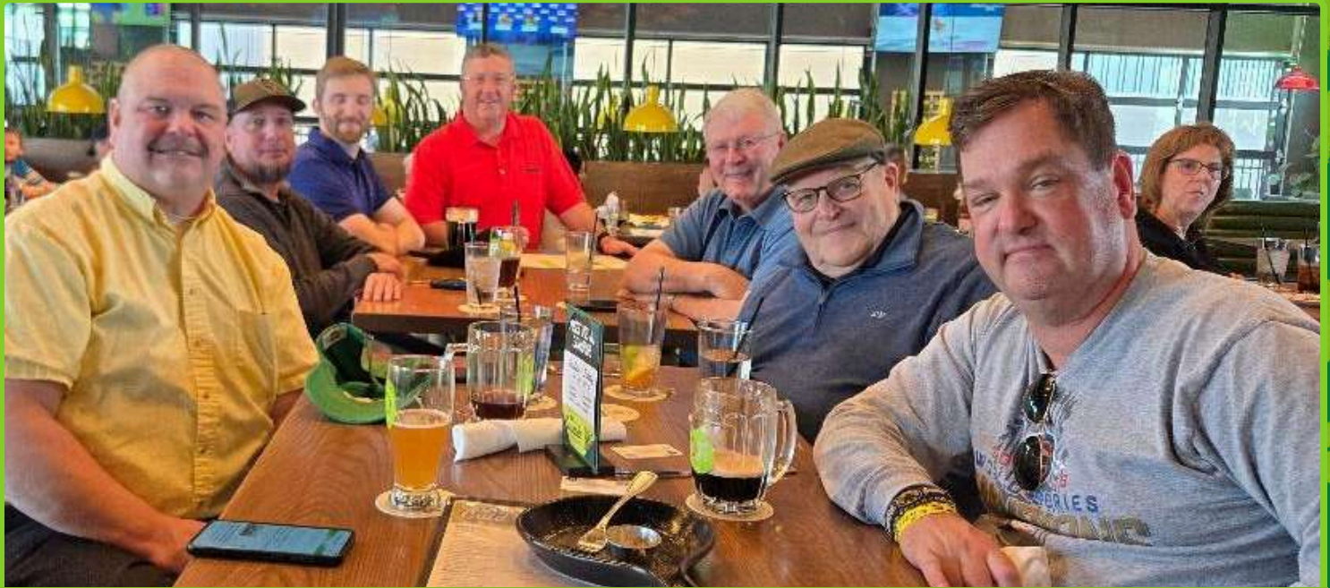
AOH Brothers Out Celebrating Happy Hour at New Sponsor 30Hop