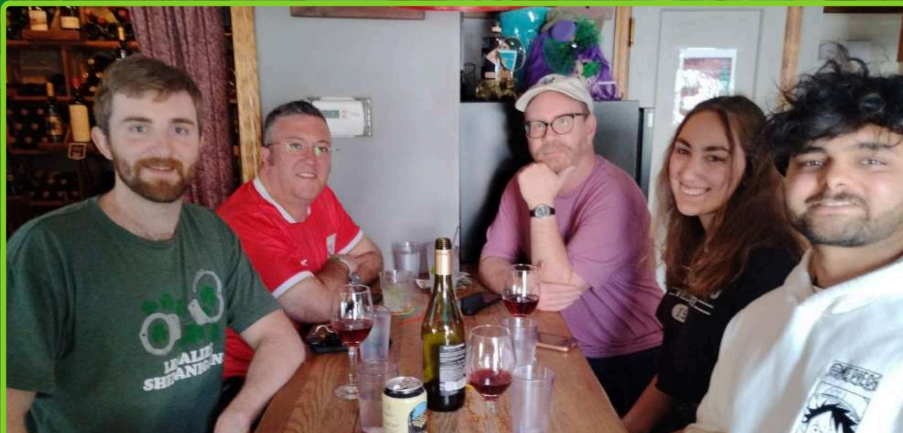
Happy Hour at 2026 New Sponsor, Dundee Cork and Bottle